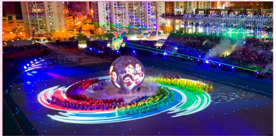
Choreographed projection and dance sequence during the Opening Ceremony